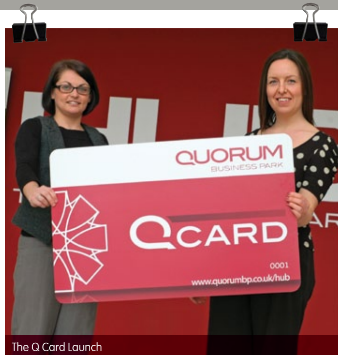
The Q Card Launch

"We are also running exclusive offers to people who register for their Q Card within the launch week including two free tickets to see a performance at Newcastle's Northern Stage, a free cut and finish at Mellors & Taylor hair salon in Four Lane Ends and a month's free membership at Complete Fitness in Gosforth."